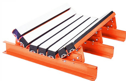
Belt conveyor buffer cradle