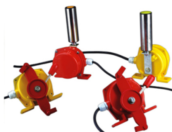
Emergency Pull Cord Switch