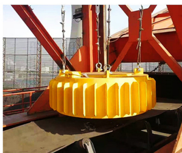
Permanent Magnet for Belt Conveyor